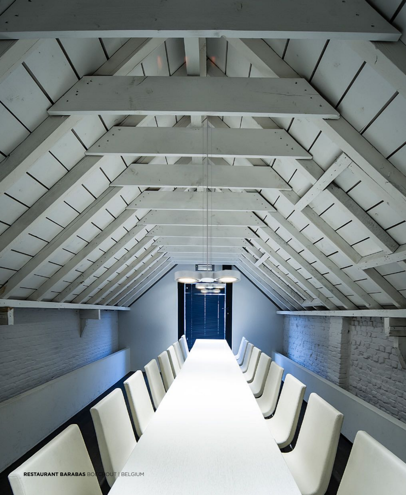
RESTAURANT BARABAS BOESBOUT | BELGIUM