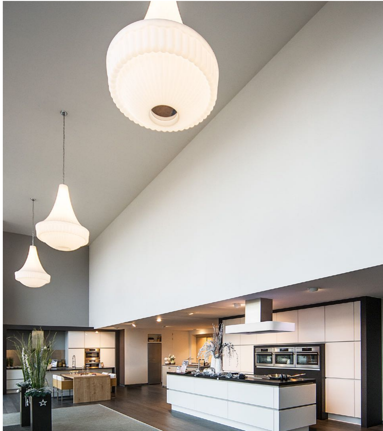
SHOWROOM KITCHEN DOVY ROESLARE | BELGIUM